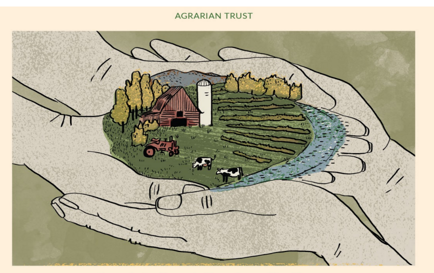
Supporting land access for the next generation of farmers

Agrarian Commons hold equity and authority in the community to manifest decommodifying land, permanent reinvestment in soils, sharing ecological stewardship, returning equity and control of land to local communities, and providing secure, long-term tenure for regenerative agriculture.